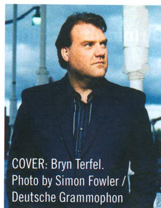
COVER: Bryn Terfel.

98 Win 32 CDs of classic Royal Opera performances, recorded live between 1955 and 1997