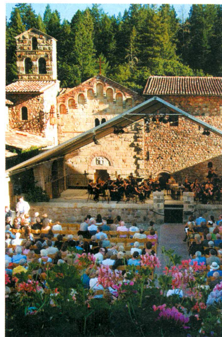
Check out our unmissable festivals guide 36