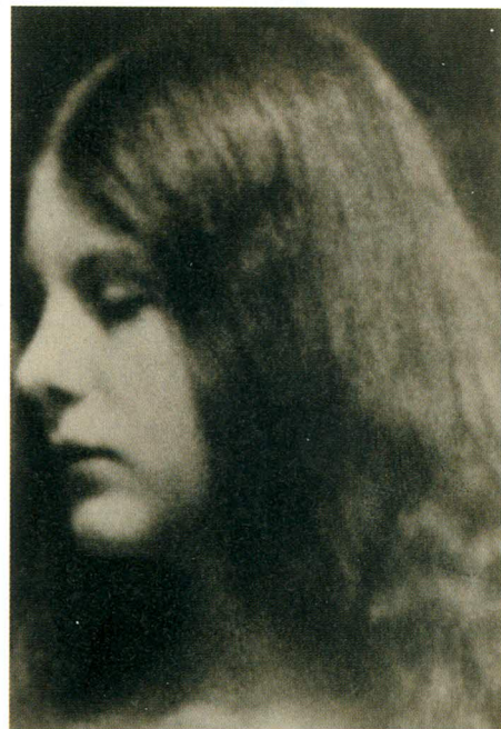
Berg’s Violin Concerto, dedicated to his “angel” (above) – the best recording is revealed 60