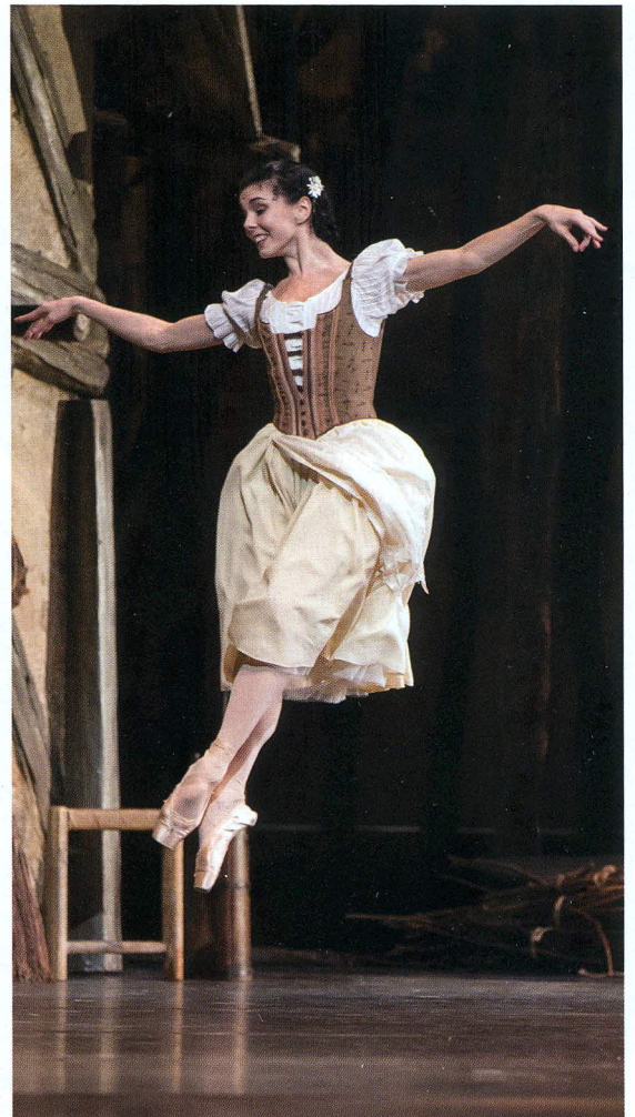
Front cover: The Bolshoi Ballet - Evgenia Obraztsova and Artem Ovcharenko in Ratmanský's Lost Illusions .