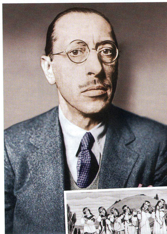
26 Stravinsky's revolutionary Rite is 100 this year