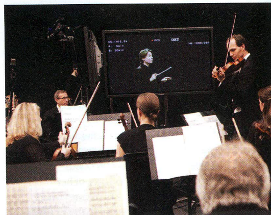
18 The Philharmonia Orchestra explore the Planets