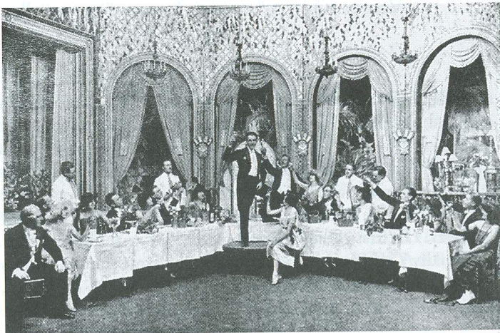
First Night in London in 1920

Stasi has been forced on to the Prince, but she loves Count Boni, and he returns her love. The status-conscious old Prince is compelled to give his blessing to Edwin and Sylva when it comes to light that he himself once married a chansonette who was presented to him in the guise of a "widowed countess". All ends happily for both couples and Sylva becomes a "real" princess.