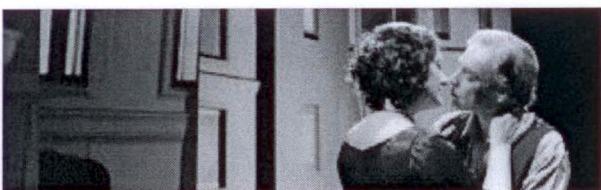
From La Boheme with The Estonian National Opera, foto Hannu Rospu.

The scenography with sliding walls showing digitalized background functioned some of the times well, for example the opening background picture with winter, ice cold trees and snow falling down was very beautiful, for me some times the moving houses was a bit like Disney houses. And the contrasts could have been tuned down some. But with the sliding walls we got possibilities for new views into the stage, for example when the three friends of Rodolphe is singing to him and ask him to hurry up, the sliding walls did so we could see them standing outside his window, as we at the same time was inside in the house. The same happened when Mimi and Rodolphe is leaving for Momus, they ended the duet in the middle on the stage, but so it looked that they were on their way out through the sliding walls. Very well done.