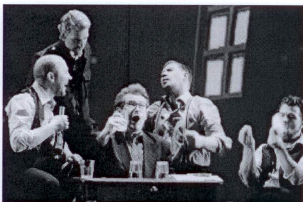
La Boheme